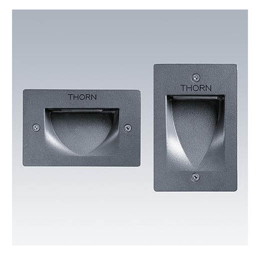
Photographs, line drawings and photometric data are representative only. For specific product detail please select an individual product.